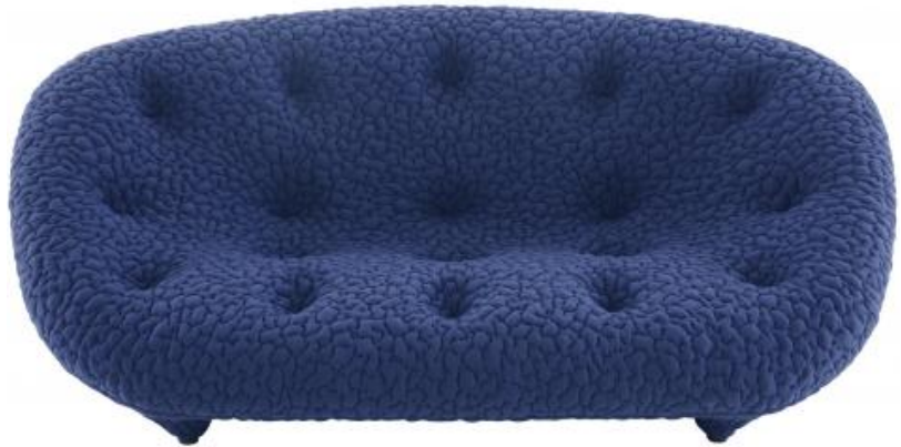
SMALL SETTEE LOW BACK